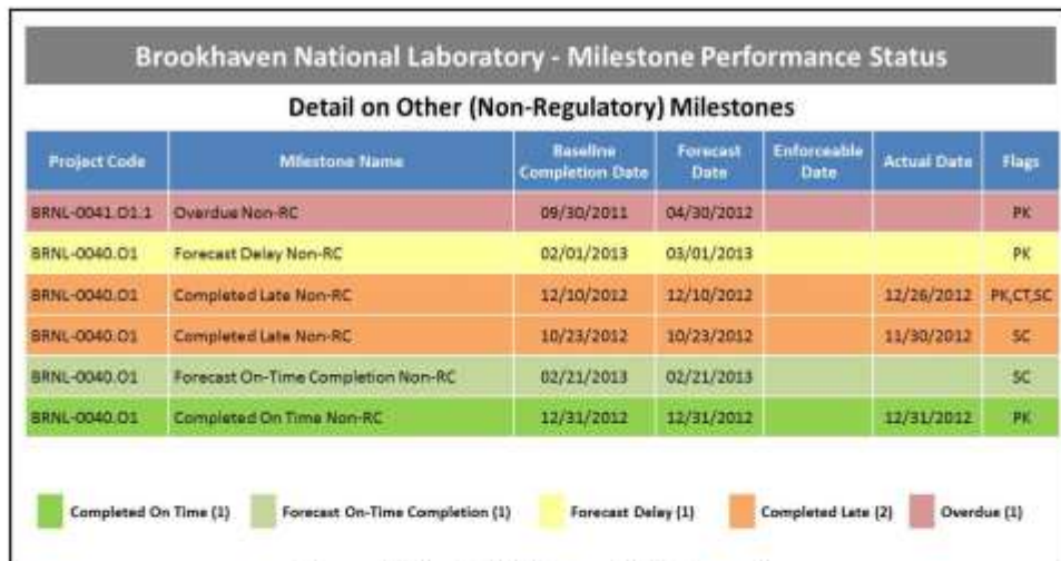
Figure 4: Non-RC Milestones Slide Example