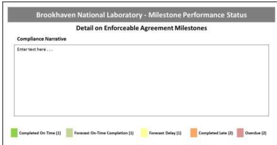
Figure 3: EA Milestones Narrative Slide Example