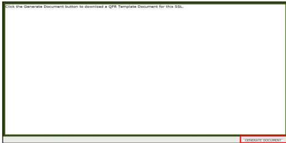
Figure 1: Generate Document button

Once the button is selected, the QPR package will be generated as a PowerPoint document. Approved Milestones and Performance Measures data will be pulled directly from IPABS. All slides in the QPR package are fully editable.